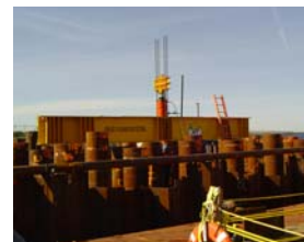
Static Load testing