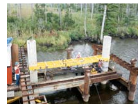
Lateral Static Load testing