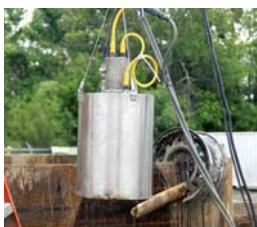
Shaft Inspection Device