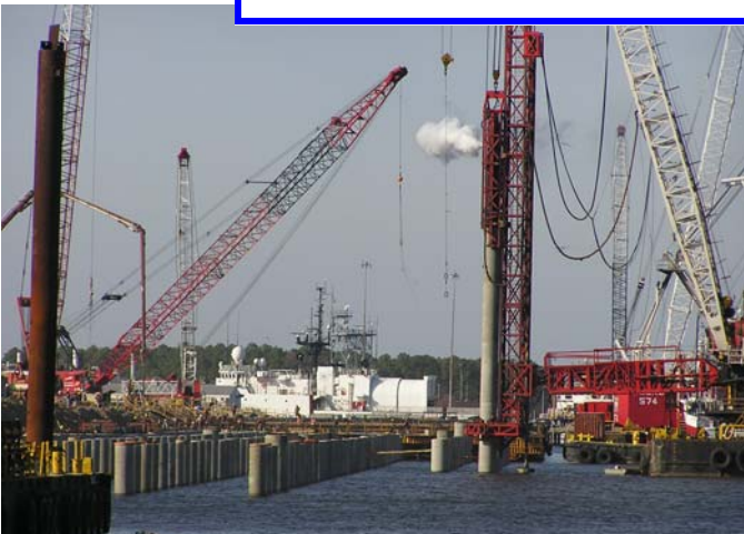
30 MN Statnamic Load Test on 54-inch Production Cylinder Pile