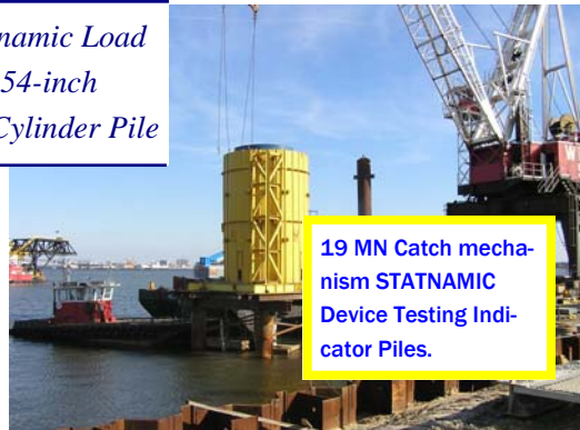
19 MN Catch mechanism STATNAMIC Device Testing Indicator Piles.